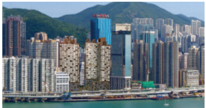
Hotel Alexandra on the North Point waterfront