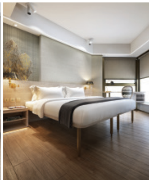
Diamond Double Bedroom