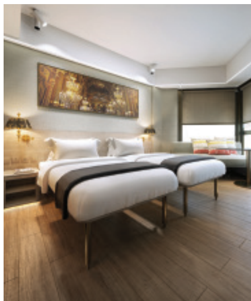
Clover Twin Bedroom

840 charming guest rooms and suites with many overlooking the spectacular Hong Kong skyline and Victoria Harbour views. A selection of card suit room categories ranging from 2 persons 'Diamond' to 6 persons 'Spade' and luxury 'Queen & King Suites', with choice of double or twin rooms and writing desk or bed sofa. A host of connecting rooms for family and group travellers, as well as spacious suite options for the long staying or discerning.